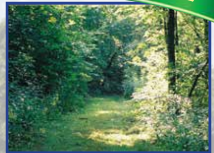
Trails for walking and equestrian enjoyment