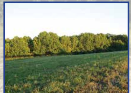
Homesites on the meadow