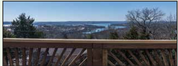
TABLE ROCK FULL LAKE VIEW IN KIMBERLING CITY

Built in 2002, 5BRs, 3BAs with total in-law or visiting guests lower level. Peninsula fireplace in main level living room, open to dining & kitchen give a full lakeview through wall of windows. Master suite & 2 additional BRs & main BA on main level with 1BR & BA along with 2nd living room & kitchen in lower level. Upper 2-car garage plus an oversized lower level garage with heat & air & separate driveway. Massive decks provide for more of the spectacular view of TABLE ROCK LAKE . Fruit trees & flowering plants & shrubs. Professionally landscape. Timing is everything!!! #60113730. $260,000.