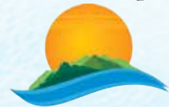
Table Rock's Best, REALTORS

TABLE ROCK'S BEST REALTORS P.O. Box 2062, Branson West, MO 65737