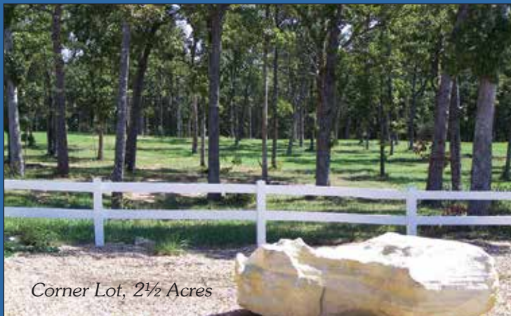
Corner Lot, 2½ Acres