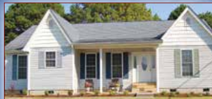
Family Togetherness On Lake Taneycomo.

If you would like your family close by...here you go. Cottage Victorian with 3BR, 2BA, formal dining and Large Living Space with fishing just across the street! $138,500.