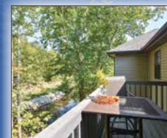
Very Desirable Location, Cozy Cove. Just Listed! $127,500.

2BR, 2BA with carport. Low monthly fees, but great amenities, pool, clubhouse, fitness, and waterfront park!