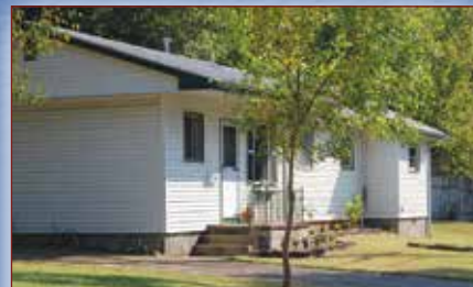
Cozy 2BR, 1BA With Flat Yard And Sun Porch On Back!

If you would like your family close by...here you go. Cottage Victorian with 3BR, 2BA, formal dining and Large Living Space with fishing just across the street! $138,500.