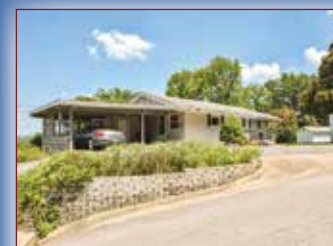
Quiet, Mature Neighborhood!

Lots of Space and close to Park. Room for a home-based business in lower walk-out and an attached apartment with separate entry. Very desirable area in City of Branson. $164,500.