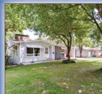
Adorable Cottage Close To Branson Landing!

Lots of Pine Trees with city utilities! $19,900.