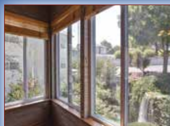
This is Unbelievable!

3 steps to Front Door to this gorgeous condo directly across from Clubhouse. 2BR, 2BA with Screened-in porch and Hot Tub. All appliances including washer/dryer. Sun Room overlooking waterfall. $119,900. Just Listed!