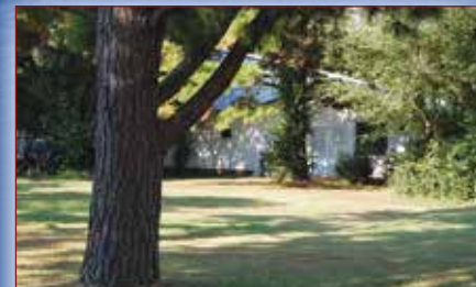
Great Lot For New Build!

Lots of Pine Trees with city utilities! $19,900.