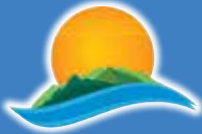
Table Rock's Best, REALTORS