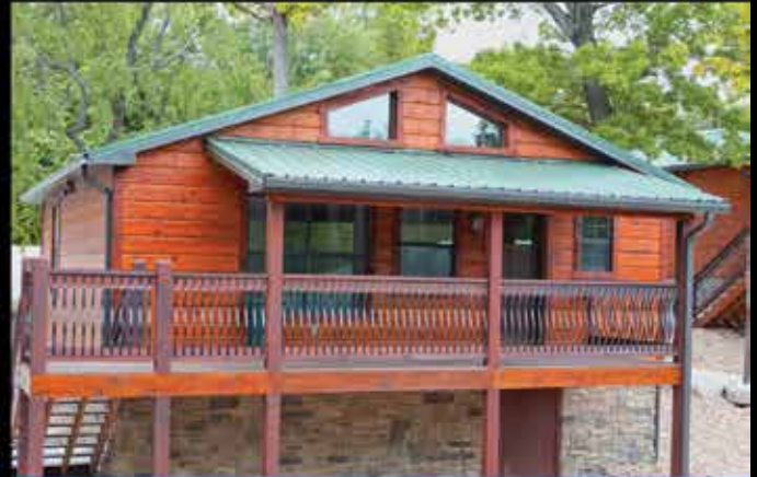
Fully Furnished Lakefront Cabins Available