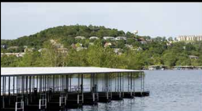
5 Boat Docks w/ 88 Boat Slips