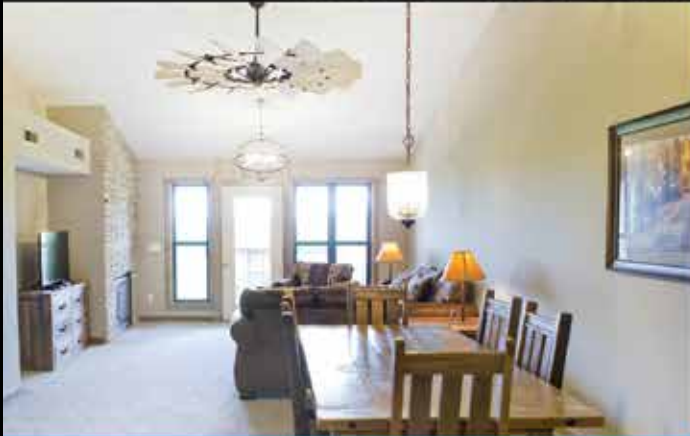
Fully Furnished Lakefront Condos Available