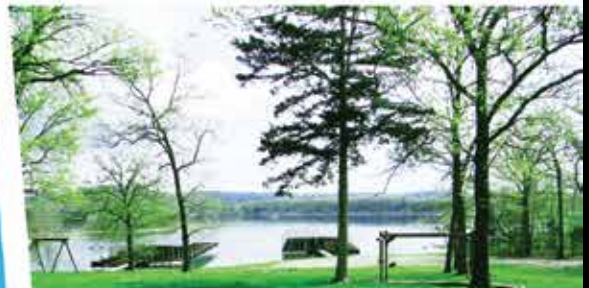
This could be your lake view!