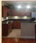
Table Rock Lakefront