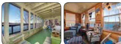
TABLE ROCK LAKE FRONT

An adorable LAKE FRONT HOME with an AMAZING VIEW OF TABLE ROCK LAKE. 3 Bedroom, 2 Bath with a large Bonus Room which can be used as a 4th Bedroom. OPEN FLOOR PLAN. Completely remodeled within the last 10 years. Private Well. Minutes from Hideaway Marina. MLS#60071839 $229,900