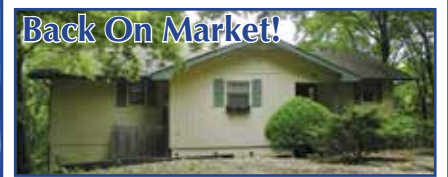
Table Rock Lake View Log Cabin! Pine hardwood floors and walls, antique replica stove, wood burning stove, hot tub on the deck. Currently set up to sleep 5, Master BR and BA on upper level. Bedroom area, full BA, kitchen and utility on main floor. Circular drive so bring your toys. Relax and enjoy the view in the hot tub on the rear deck. Close to marina. Move-in ready. #1052335. $117,500.