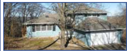
Table Rock Lake view from the deck and all rooms on the rear of the house. New roof in 2016. Space for all to enjoy their own space. Entry, living room, dining room, kitchen, extra dining are on main level. Step down to family and bonus rooms plus BA. Upper level with Master, 2BRs and a shared BA complete with walk-in shower and whirlpool tub. Lower level with cedar lined BR. 3 Decks, 2 car garage. #1034933. $159,900.

LAKE VIEW! Custom built with 2,200 sq. ft. on main level, an unobstructed Table Rock Lake view and beyond from all rooms in back of home! Living with vaulted ceiling and floor to ceiling windows. Master BR with door to deck. Main level with 2nd BR, office, kitchen, formal and informal dining, family room, full BA and utility room. Lower level with family, 3BRs, 1BA, bar and access to lower deck. #1035051. $349,900.