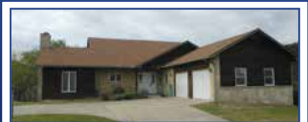
Table Rock Lake View! Main level with living room, kitchen, dining room, master BR, 2nd BR and large utility. Upper level has 2BRs and 2BAs. Walk-out bsmt with half BA. 2 car garage with access to a paved circular drive. Hardwood floors on main level. Deck with a lake view. #1002748. $284,000.

What a great location and clean house too! Across from Country Club on the 9th Fairway. Split floor plan, open concept, rear covered deck overlooking a double fairway and golf course greenbelt on one side. Living room has a propane fireplace. Master has walk-in closet, double sinks, and walk-in shower. Oversized 2 car garage. View! #1043220. $155,000.